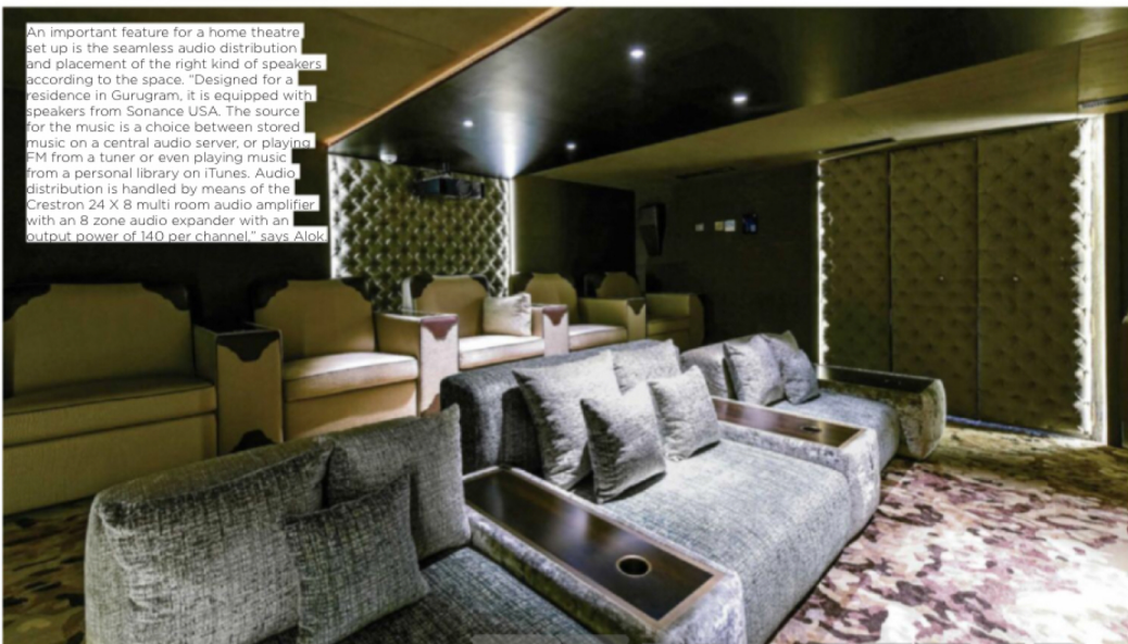
An important feature for a home theatre set up is the seamless audio distribution and placement of the right kind of speakers according to the space. "Designed for a residence in Gurugram, it is equipped with speakers from Sonance USA. The source for the music is a choice between stored music on a central audio server, or playing FM from a tuner or even playing music from a personal library on iTunes. Audio distribution is handled by means of the Crestron 24 X 8 multi room audio amplifier with an 8 zone audio expander with an output power of 140 per channel," says Alok

Off late, the latest technical interventions have made the 3D formats and Blue Rays passé. "The trend today in picture quality is to go higher and higher in resolution — 4K, 8K and even more," says Alok. "Important features, such as High Dynamic Range (HDR) and a bigger colour gamut — all