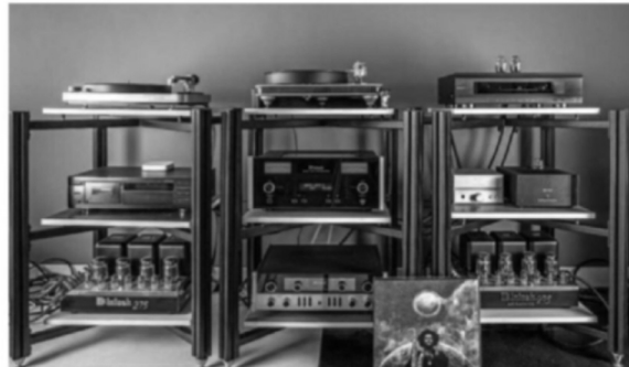
The range of McIntosh turntables and home theatre systems.

"Video projectors have become a mass market product as it replaces the LEDs and LCDs big time. It allows you to have a larger screen as compared to a LED which is 60 or 70 inch, and almost half the price. There are now projectors readily available